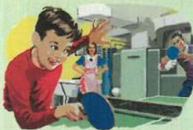
TABLE TENNIS : EVERY FRIDAY 5.00PM (Closed 20 & 27 Dec.)